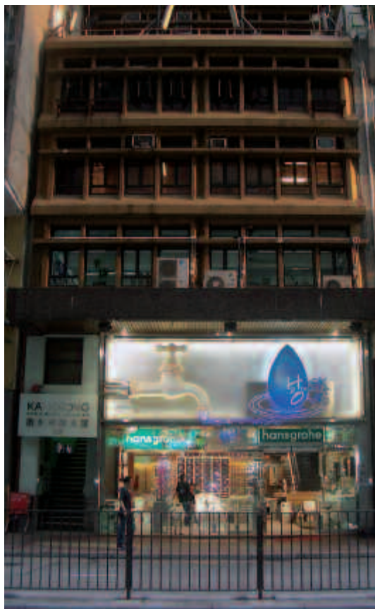
Barriers exist near the water's edge throughout the city, making it difficult for pedestrians to have access to the waterfront.

A vision is more than just a statement of goals—it is a roadmap for action as well as an expression of the hopes and aspirations of the residents and all interested parties. A vision must not only express the big picture—the place the stakeholders want the harbour to be—but also recognise that realizing a renewed waterfront takes time and is built of many actions, at different scales and with diverse timetables. Critically, the vision coordinates all of those actions and directs them toward the common idea. It recognises that the value of the waterfront is more than just the price of individual sites, comprising the overall value of a comprehensive waterfront that enhances everything along its entire edge.