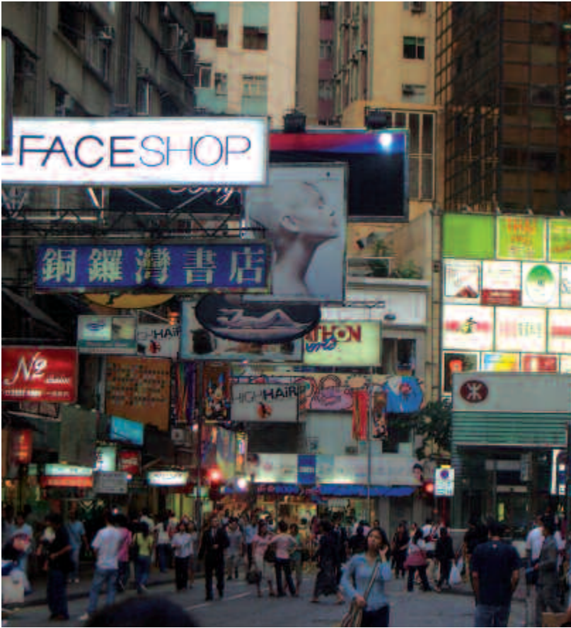
The city of Hong Kong is a vibrant, bustling world-class city.